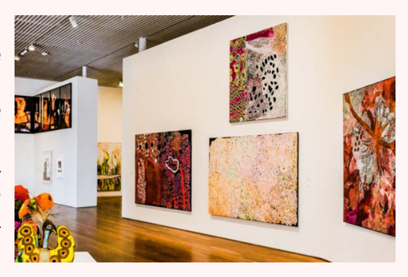
CHAN WEI KEE UCAE

In the end, cultures can be seen as evidence of a successful growth for a city but it is a challenging to maintaining diversity and balancing the views of all parties.